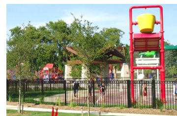
Splash Park Picnic & Outdoor Service August 22