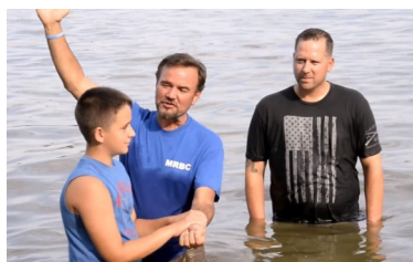
Baptismal Service at the Lake August 8

These are just two of the outdoor services we have planned this summer. We will see you there!